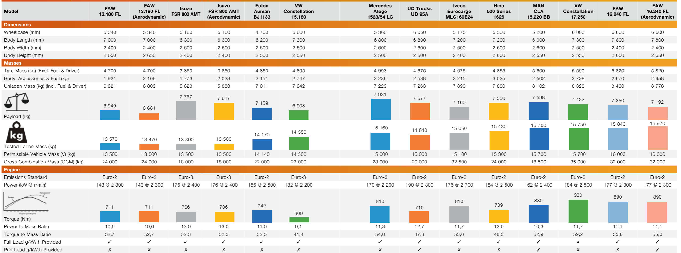
Route: Engen Hartebeespoort to Gerotek Return | Distance (km): 89